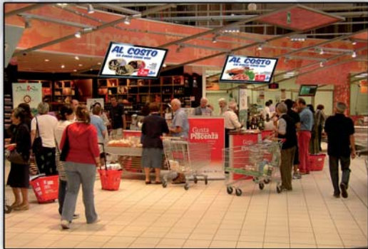
Large Distribution Chains